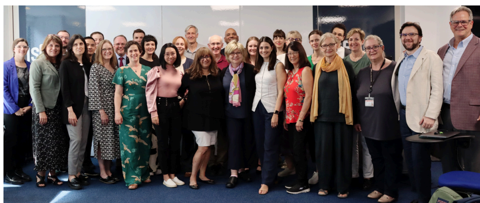
Pre-conference Day: Musicians' Health Advocacy Convergence Activity that kickstarted the clinical competencies project along with other exciting musicians' health initiatives! July 17, 2024, at Institute of Sports, Exercise and Health, University College London.